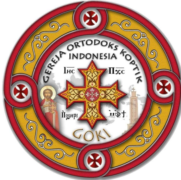
Lampiran 1. Logo Gereja Ortodoks Koptik di Indonesia