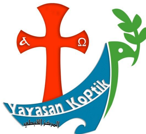
Lampiran 2. Logo Yayasan Kristen Ortodoks Koptik di Indonesia