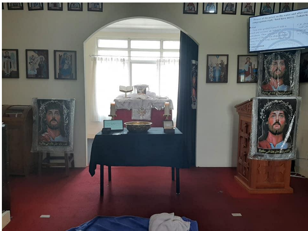
Lampiran 4. Interior Gereja Ortodoks Koptik Surabaya