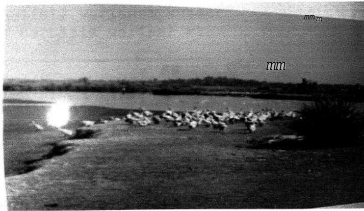
Foto tempat penggembalaan itik