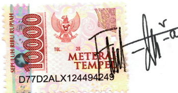
Fidella Malva Zatadini