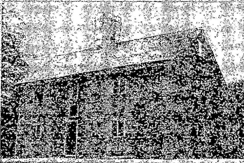
The Rebecca Nurse homestead in Salem Village (Danvers, Massachusetts)