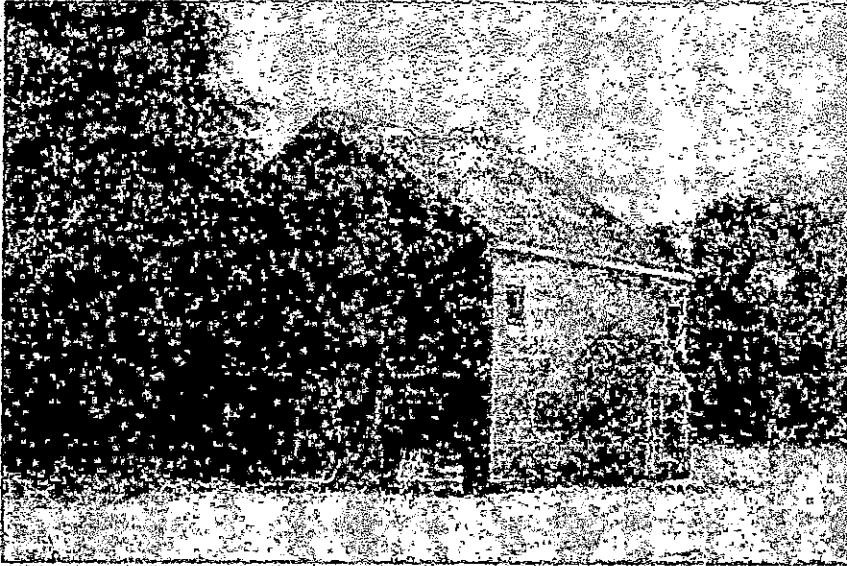
The reconstructed meetinghouse