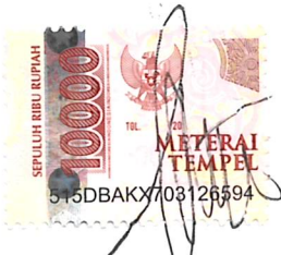
Bimo Satrio Putranto